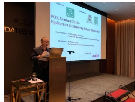
PCCC seminar: Updates on the Evolving role of Biosimilars